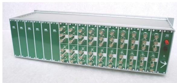
BH193/196 (left) and integrated in a BH220 (above)