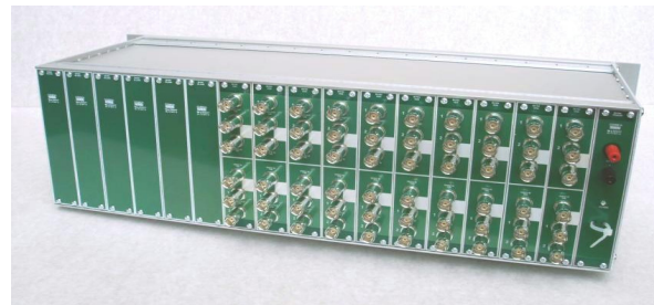
BH192/196 (left) and integrated in a BH220 (above)